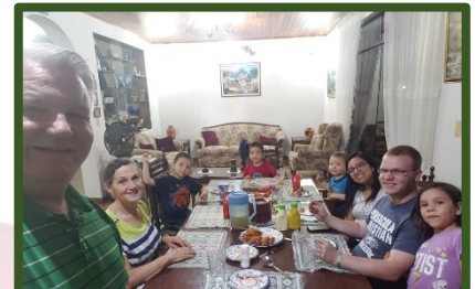
First Night Back in San Ramón